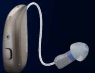
Beltone Envision microRIE Warm Grey