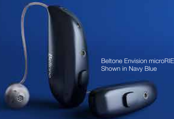
Beltone Envision microRIE Shown in Navy Blue