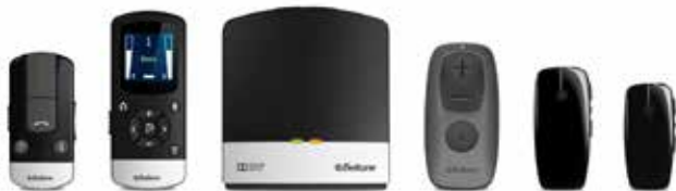
Phone Link 2