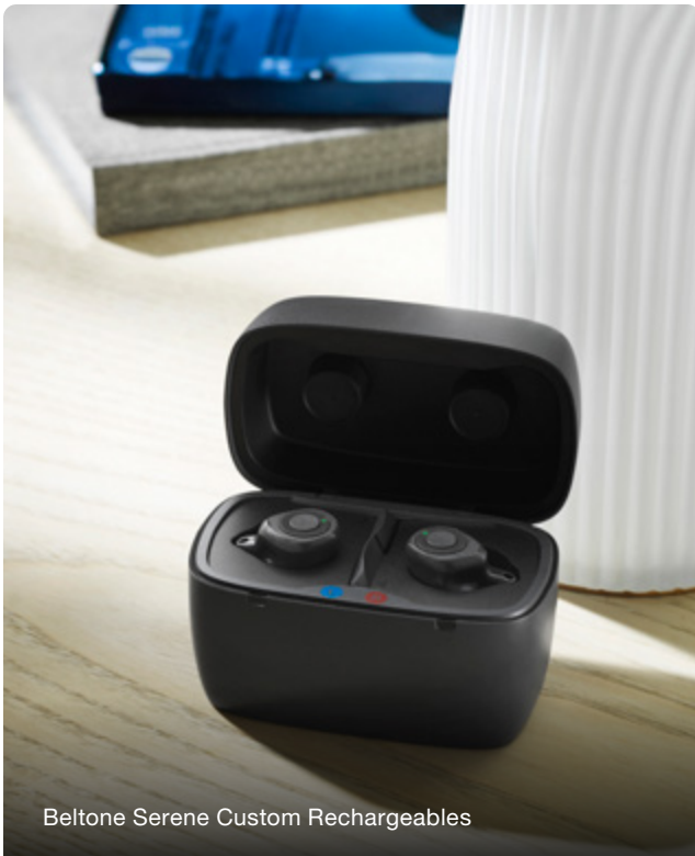
Beltone Serene Custom Rechargeables