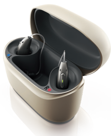
Phonak Charger RIC Infinio for cable charging