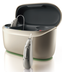
Phonak ChargerGo RIC Infinio with built-in battery for charging on the go