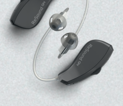
WORLD'S MOST ADVANCED RECHARGEABLE SOLUTION

The same clearer, fuller and richer sound is available in two discreet hearing aid models. In addition to the small and long-lasting rechargeable solution, ReSound LiNX Quattro also offers a replaceable battery solution with a standard zinc hearing aid battery. With low power consumption and high-level performance, you can enjoy the serenity of nature or bustle of the city with complete confidence.