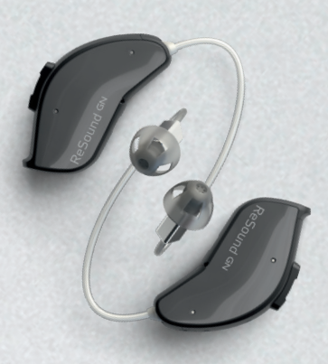
REPLACEABLE BATTERY SOLUTION