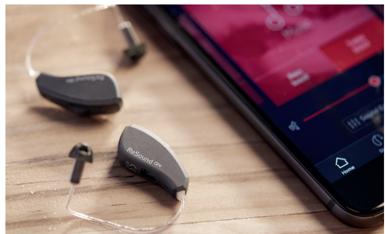
ReSound Smart 3D<sup>™</sup> app