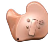
In-the-Ear Full Shell (ITE FS)