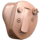
In-the-Ear Half Shell (ITE HS)