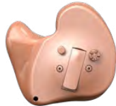
In-the-Ear Full Shell (ITE FS)